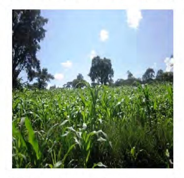
Figure 9. Maize farm with VG, Tulube

In addition, the study confirmed that the maize with vetiver grass hedgerows was greener and had grown better than the maize without vetiver grass (Figs 9 and 10).