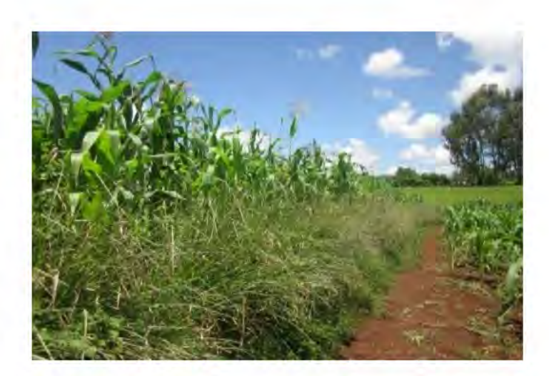
Figure 7. The dense vetiver grass hedgerow on farmland in the study area

All the vetiver grass user households unanimously agreed that the vetiver grass has strong, deep and fibrous roots that slowed runoff water and trapped sediment (Table 6) and it was acclaimed as the best on-farm erosion control method. The outcome of the focus discussion indicated that vetiver was best and effective when planted in rows on sloping farm lands and has been used successfully for flood and erosion control on the flood plains of the study area. All farmers appreciated the vetiver grass capacity to reduce the velocity and distribute heavy runoff along the hedgerows and terminate its erosive power. As a result, soil erosion was controlled so that sediment and nutrients were trapped on site.