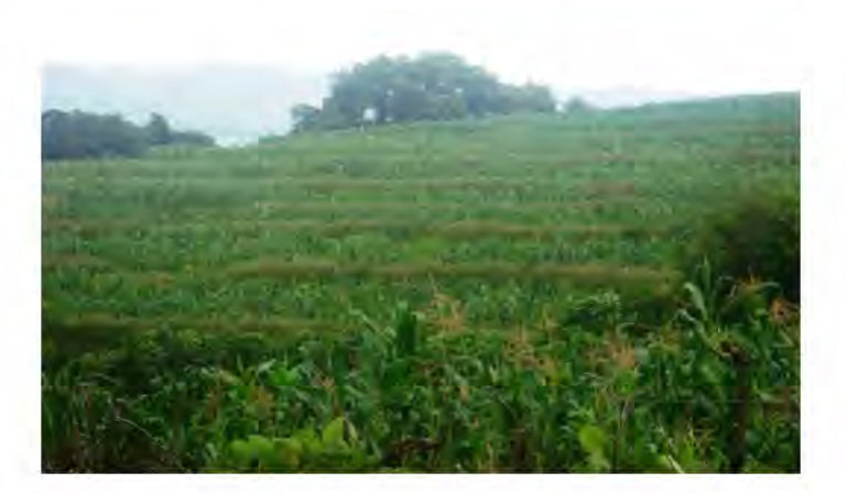
Figure 8. Vetiver hedgerows on maize farm, Tulube

grass in highland agriculture as a means of controlling the erosion on farmland located on sloping topography.