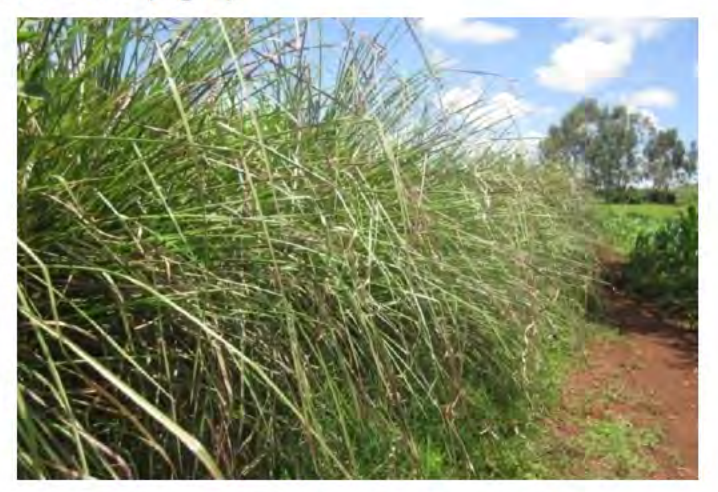
Figure 2. Vetiver grass hedgerow, Tulube

research result, vetiver grass was effective both alone and/or combined with other traditional and modern methods of SWC (Fig. 2).