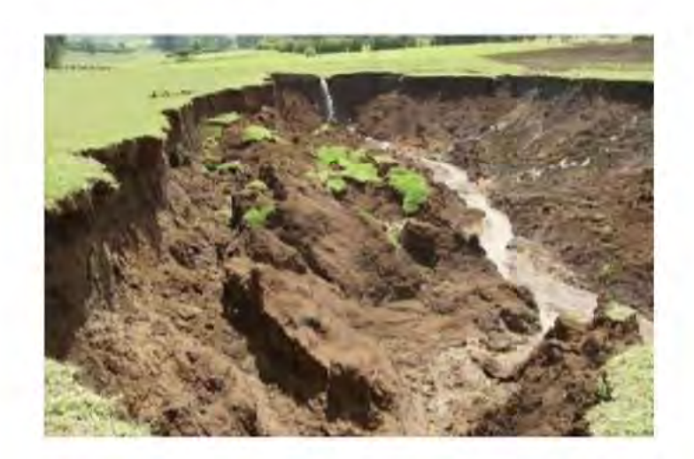
Figure 6. Effects of soil erosion in the study area