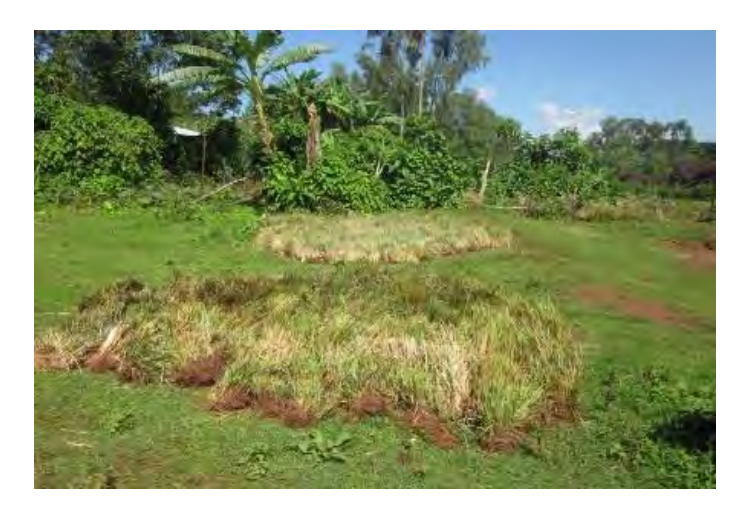
Figure 5. Vetiver grass clumps used for propagation at Tulube

their farmland and planted 700 to 1,000 vetiver grass tillers (shoots). It was also noticed that some farmers were planting vetiver tillers without making fanya juu terraces to save labor and time. The study found out that once the farmers were supplied with the initial planting material, within a short period they multiplied clumps from their plot for further expansion and sale.