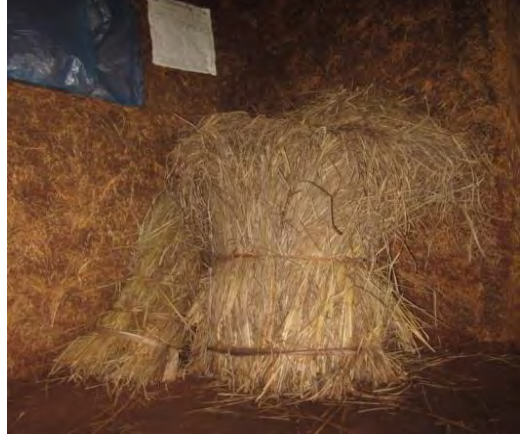
Figures 13. Vetiver leaves ready for sale