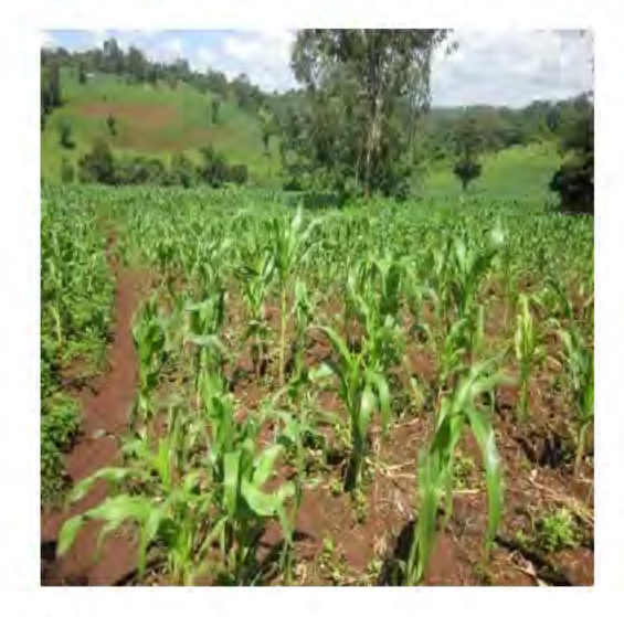
Figure 10. Maize farm without VG, Tulube