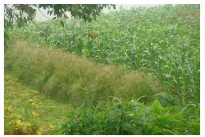
Figure 3. Highly dense vetiver hedges, Tulube